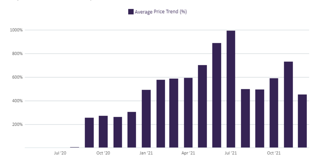
Figure 3. Medication price trends between June 2020 and December 2021