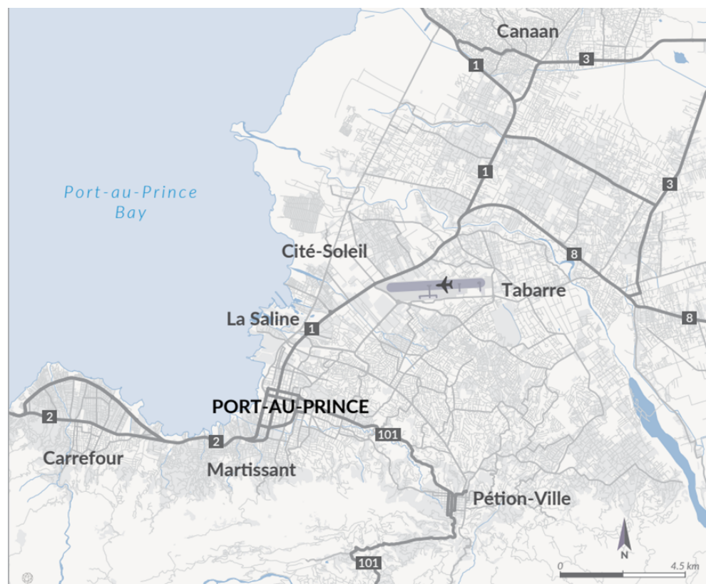
Map 1. Relevant communes and national roads in and around ZMPAP.

From August to November 2023, Port-au-Prince commune reported the highest number of humanitarian access incidents within ZMPAP (71), followed by Croix-de-Bouquets (59), and Pétion-Ville (41) (OCHA 25/12/2023). Since September 2023, there have been increased gang clashes over control of National Roads 1, 3, 8, and the 101. These roads enable travel between ZMPAP and the rest of the country, including for the purpose of trade and humanitarian assistance. Gangs along National Road 1, which connects Port-au-Prince to Gonaïves and Cap Haïtien, regularly abduct, kill, and commit sexual violence against travellers on this road (GIATO 12/02/2024; BINUH 01/02/2024).