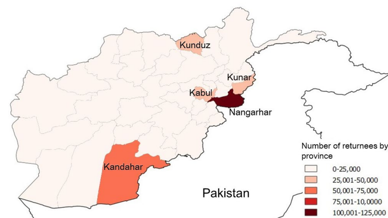
Map 1. Main provinces of return